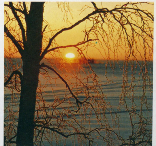
The Finnish countryside in winter