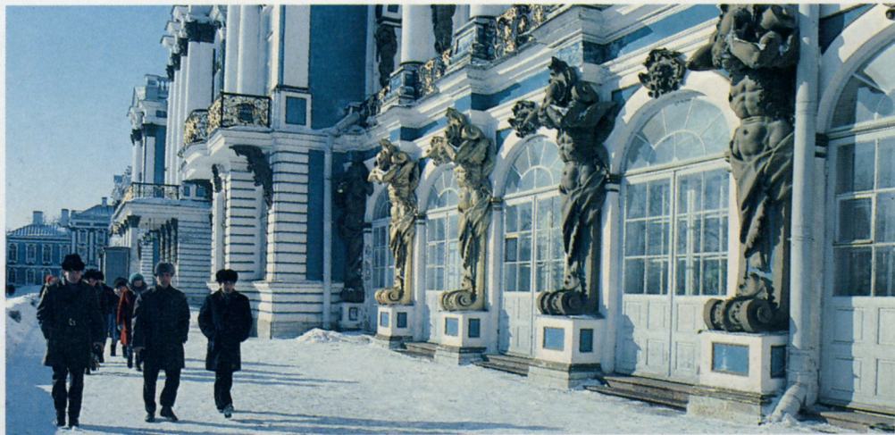
Leningrad's Pushkin Palace