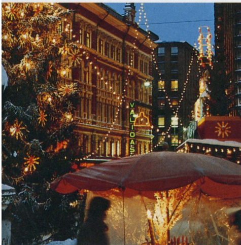
hish Christmas decorations

Tour price is based on airline and hotel tariffs as of September 1, 1985 and are subject to change without prior notification.