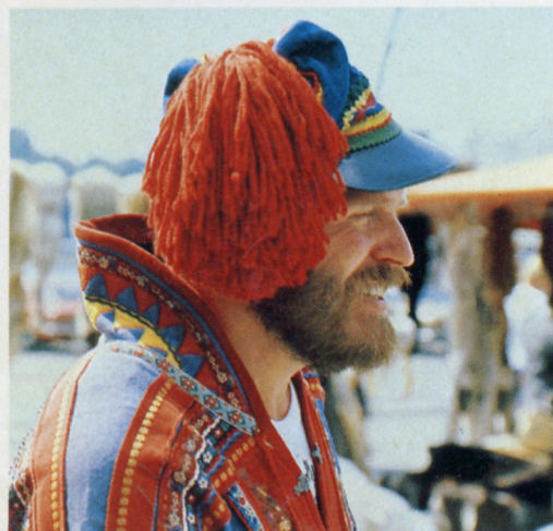
A Lapp in native costume