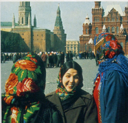
Red Square, Moscow

Lenigrad is an opulent city of hundreds of canals and graceful bridges. It is one of the Soviet Union's industrial, scientific, cultural and political centers. There will be ample time to enjoy its magnificent squares, parks, St. Isaac's Cathedral and The Hermitage filled with much of the world's finest art treasures. It possesses a network of subway stations that look like entrances to an 18th century ballroom, including chandeliers and beautiful mosaics. In Leningrad we will be meeting with Soviet citizens