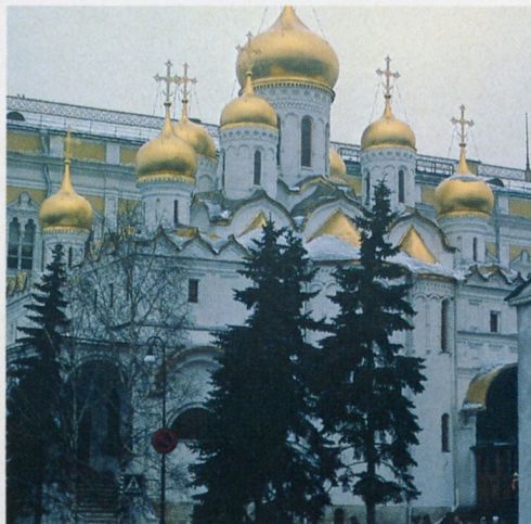
Cathedral within the Kremlin