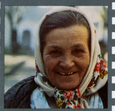
Russian peasant woman