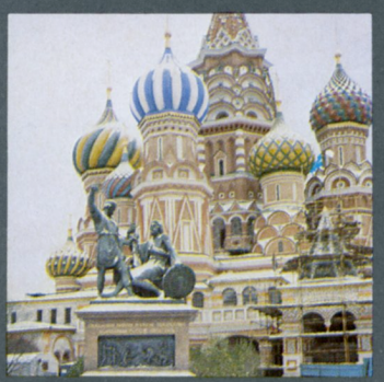
St. Basil's, Moscow