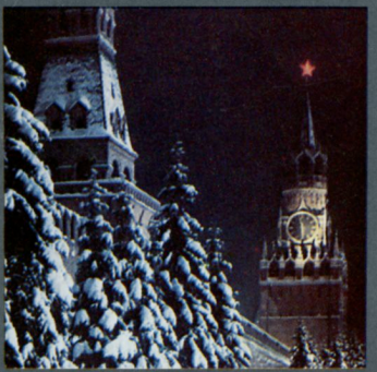
The Kremlin in December