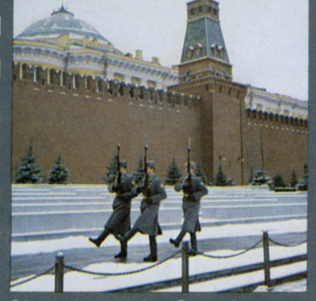
Changing of the Guard,